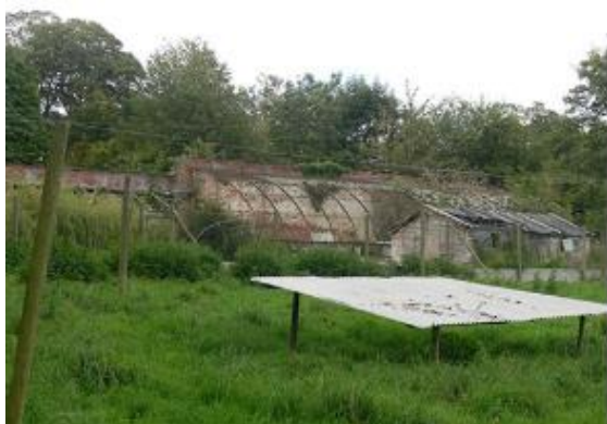
At the beginning - the walled garden and dilapidated glasshouse