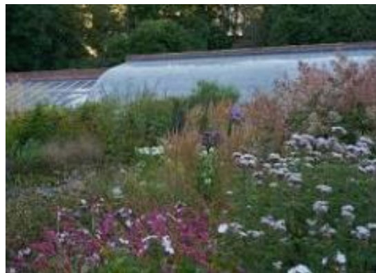
After restoration – a complete transformation

Rather than the traditional restoration of a kitchen garden, the Willgosses have created a modern garden with a series of interlocking rooms divided by hedges: visitors are surrounded by tall plants, with glimpses into the next area to entice them in. Jack described some of the plants that contribute to the personality of the garden, such as Serratia Bulgaria , a tall plant with white thistle heads; Ansonia 'Ernst Pagels', which has yellow foliage in autumn; Hemerocallis 'Brownie Points'; Silphium perfoliate , with yellow daisy-like flowers; and Patrina monandry , with flat heads of acid-green flowers.