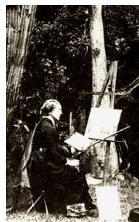
Marianne painting with oils in the jungle in full Victorian dress.