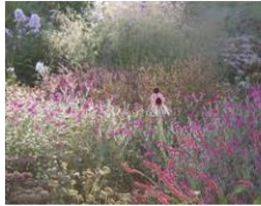
A stunning garden filled with late-flowering perennials