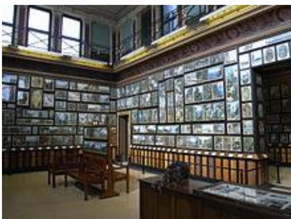
Marianne North Gallery at Kew filled with her exquisite botanical paintings