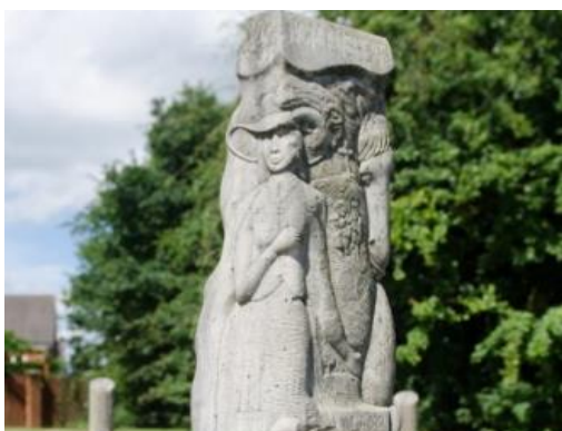
The Celia Fiennes Waymark in Back Lane, No Mans Heath near Malpas